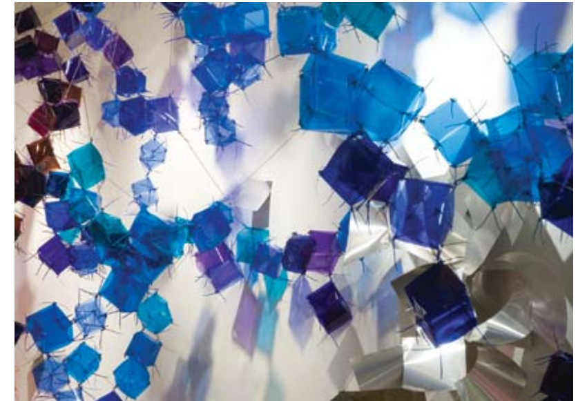
A Splendid Order , 2004 Elizabeth Harris Gallery, NY (above)