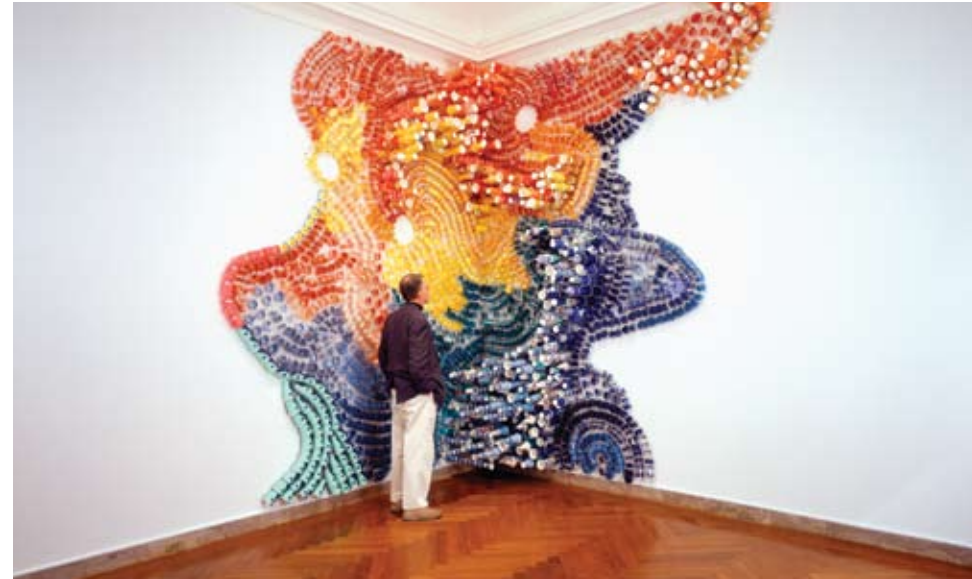
The Gravity of Color , 2005 Addison Gallery of American Art, Andover, MA