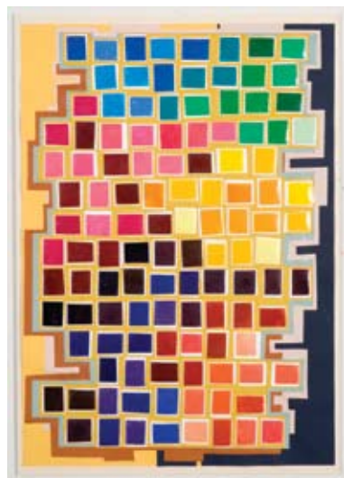
Untitled, 13 x 20 inches, 2007