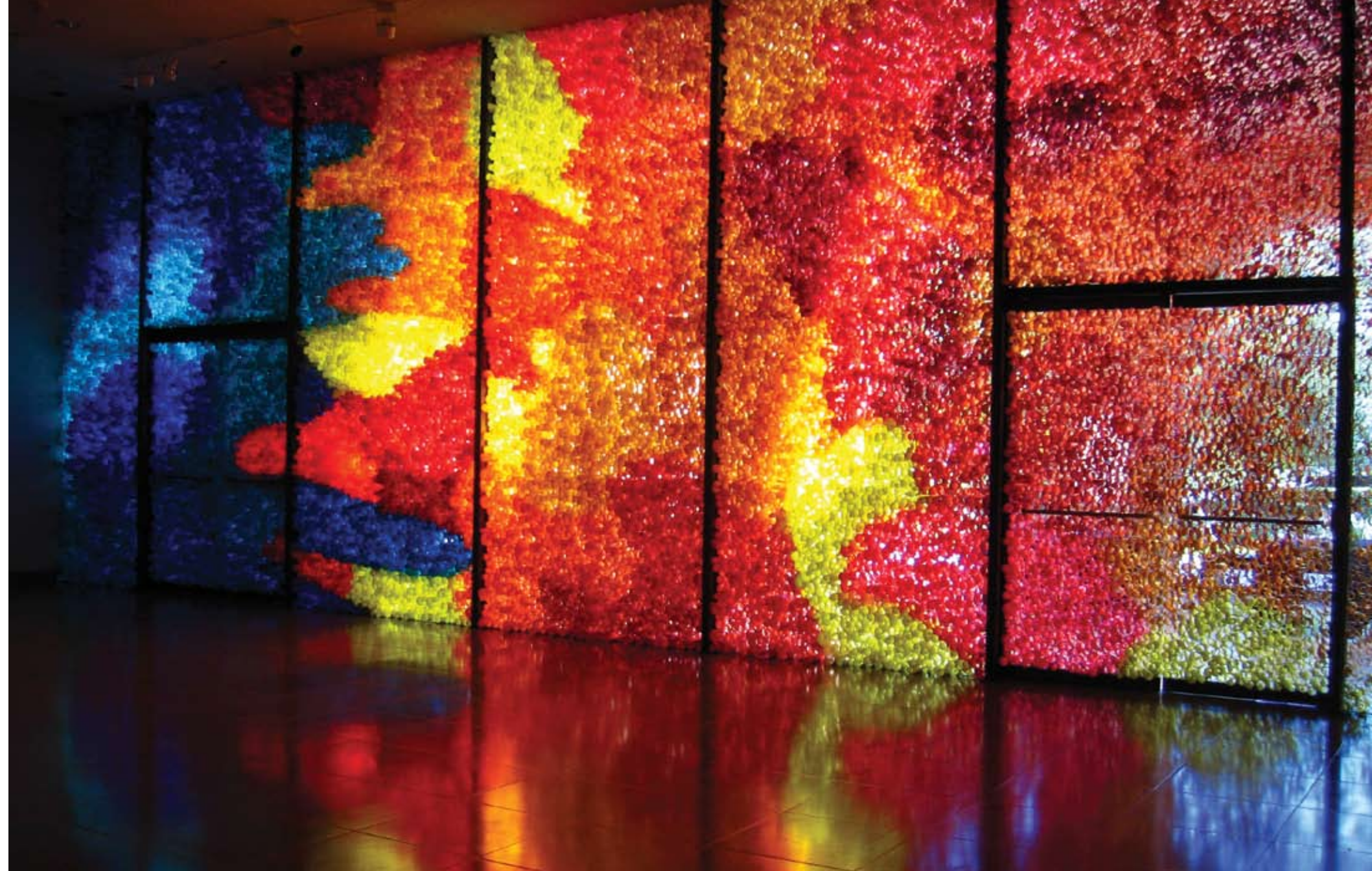
Light My Fire 2006 Rice University