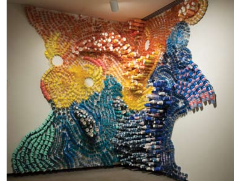
The Gravity of Color , 2005 Katonah Museum of Art, NY