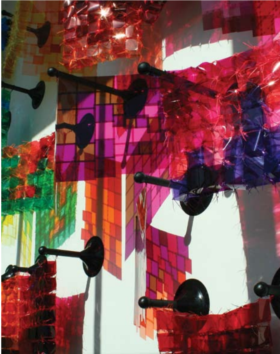
Moody Blues, Reds and Yellows , 2007 Montclair Museum of Art, NJ