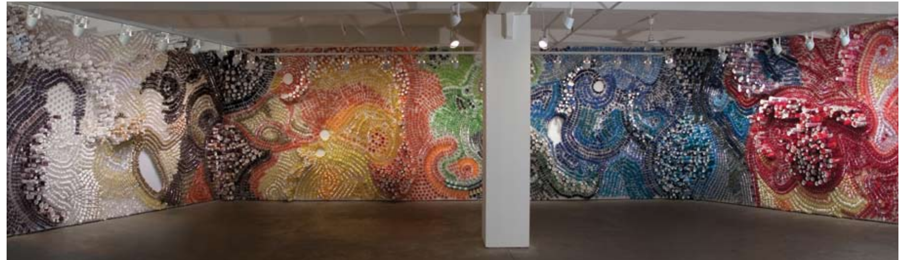
The Gravity of Color , 2004 Elizabeth Harris Gallery, NY