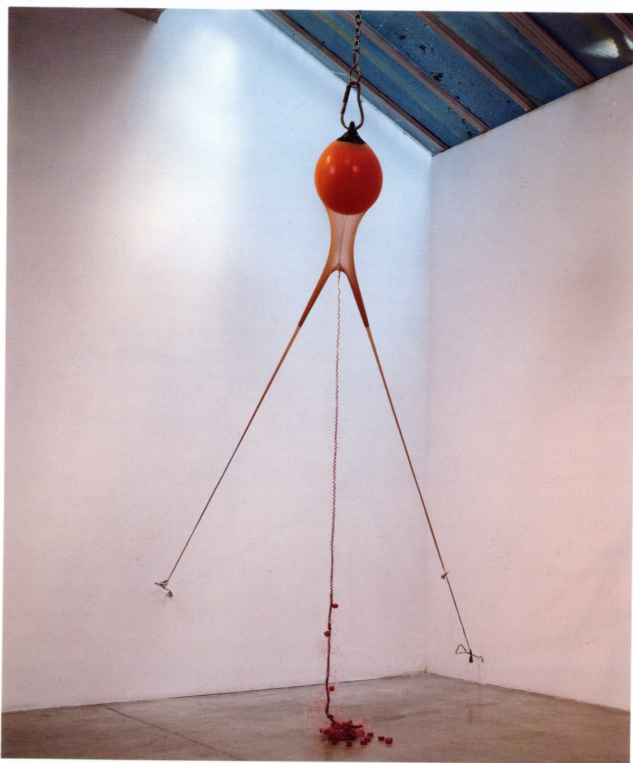
L.C. Armstrong, Emergency Exit , 1992

Armstrong addresses the tensions between feminine sexuality and procreative urges in Emergency Exit , 1992. The red fisherman's buoy which acts as the central focus is suspended in air by a pair of nylon pantyhose slipped over the buoy and splayed to wall anchors. Emanating from the buoy is a telephone cord that ends in a tangle of wires and letters. With its weird satellite-like anatomy, Emergency Exit reads like an amulet of dislocation; of sex, violence, and misperceived communication. Contrasting these negative connotations, the image of birth restrained embodied in Emergency Exit expresses the contradiction of revelation and concealment that forms the core of Armstrong's work. Probing past the elaborate material oddness of Armstrong's sculptures, we begin to notice the irony implicit in her title. As the artist acknowledges, "I don't think that romanticism and formalism have to work in opposition. I start with a conceptual base; I sometimes use the strategies of minimalism, but I try to add to that the intuitive or sensuous aspects." 5