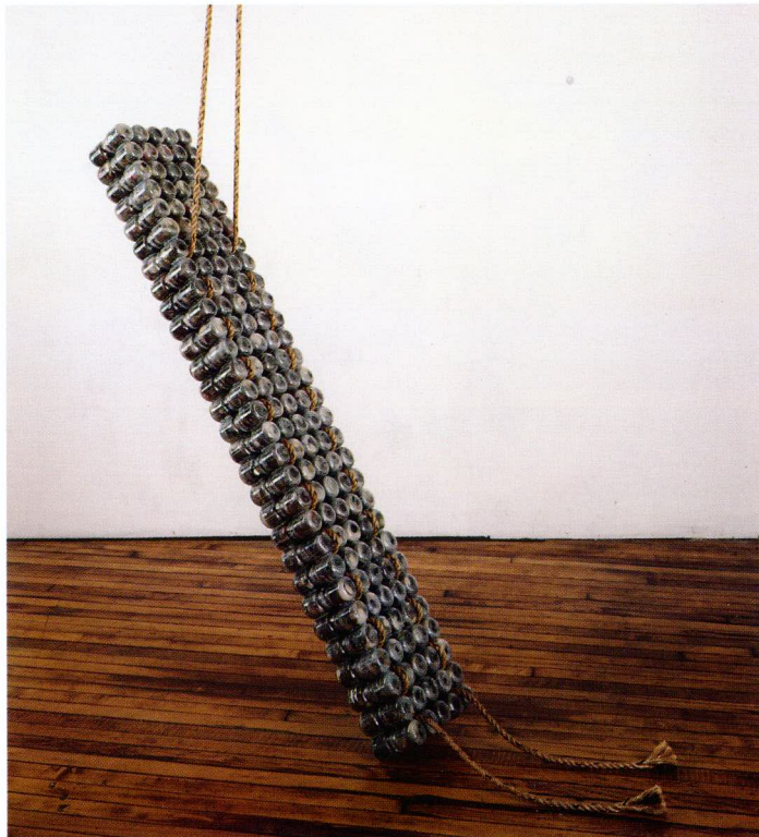
Lisa Hoke, Mouth to Mouth , 1992