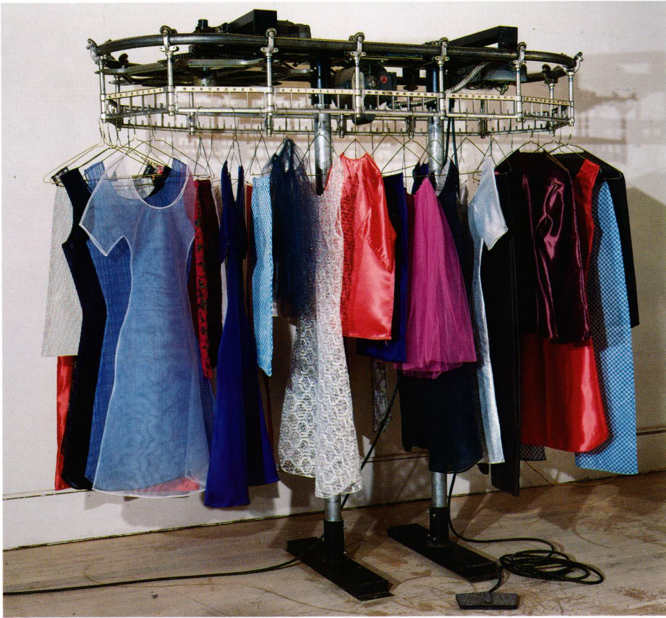
Suzan Etkin, Dry Clean III , 1990-91

The mirror promises so much and gives so little, it is a pool of swarming ideas or neoplatonic archetypes and repulsive to the realist.