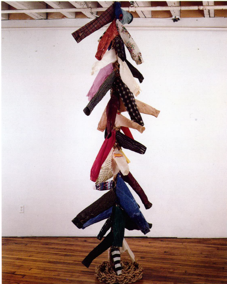
Lisa Hoke, Lifeline , 1992

Lisa Hoke uses everyday essentials, such as shower curtains, zippers, clothing, and buttons as the raw material of her sculpture, inverting the minimalist notion of materials drawn from life by expanding the circle of experience to include materials tied to domesticity, hearth, and home. Through obsessive processes of gluing, sewing, or weaving, Hoke expresses the metaphysical function of physical reality by establishing a tense spatial symmetry that involves a dynamic equilibrium between gravity and matter. In Recollections , 1992, Hoke takes as her starting point a clear vinyl shower curtain patterned with colorful dots. Upon this ground she arranges a collection of stylish buttons. Like Etkin's prototypical