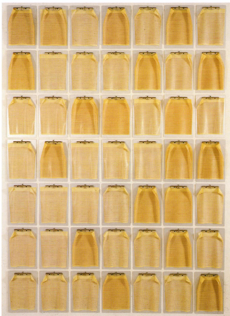
L.C. Armstrong, Seven Times Seventy , 1989

In a manner similar to the repetition of mute pages in Seven Times Seventy , the multitude of pencils in Dream Machine , 1992, evokes communication rendered silent by our disinclination to risk the pain of interaction. The 3,742 sharpened pencils protruding from the mattress of an adjustable hospital bed are provocative signifiers of our often mechanistic obsession with communication, and how that need manifests both helpful and hurtful impulses. Beds can suggest the creative side of life, including birth, dreams, and sex, but they can also serve as the site of our physical decline, from the loss of mobility, to sterility, and even death. Transforming a basic utensil of healing into a procrustean bed of nails, Armstrong conjoins religious and sexual connotations of care and caregiving. Allowing her motorized bed myriad possibilities of adjustment, Armstrong creates a work in progress whose variety of settings effectively visualizes an absent figure acting out a contortionist's routine in search of a position that will sustain comfort and communication. Dream Machine presents a fetishistic icon that, simultaneously seductive and repellent, embodies the duality of comfort and pain, pleasure and terror that marks human existence.