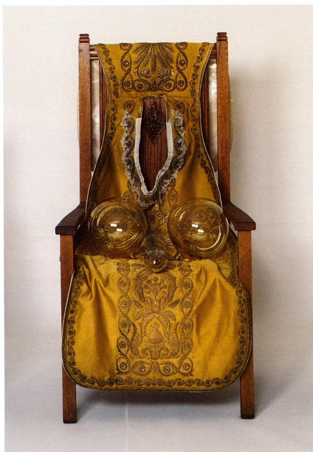
Michèle Blondel, God is Love , 1990 (detail)

Encased within the stately confines of a library case, Blondel's objects of Intimacy and Purity , 1985-92, are presented as relics of lost innocence. This musée sentimental is an eccentric repository of anonymous objects—children's shoes, filmstrip boxes from the 1950s, a stereoscopic photo viewer—that are permeated with a sense of nostalgia. Confusing distinctions between our innermost feelings and the lasting power they hold over our social discourse, Blondel wants us to project our memories onto these simple but suggestive elements. However, once